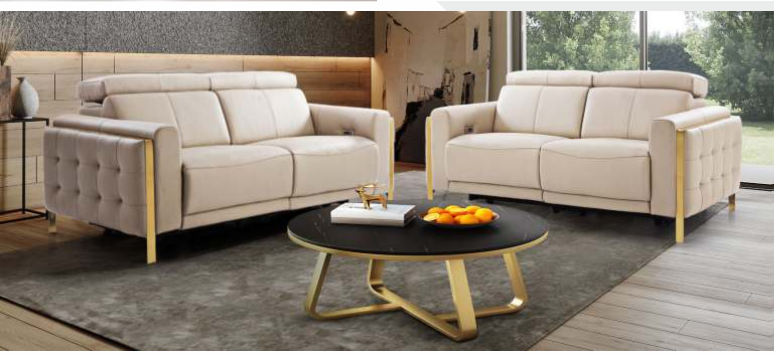
India's dedicated B2B International Furniture + Design Marketplace

Inviting: Dealers, Retailers, Franchisees, Entrepreneurs, Consultants, Architects & Interior Designers, Real Estate Developers, Corporate Sourcing Heads from across India